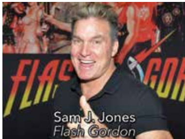
Sam J. Jones Flash Gordon