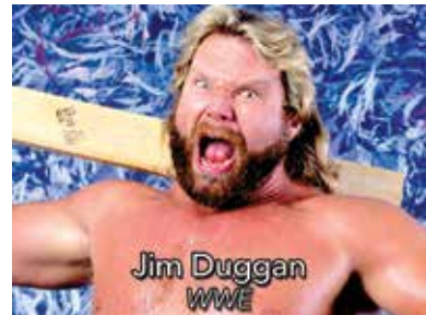
Jim Duggan WWE