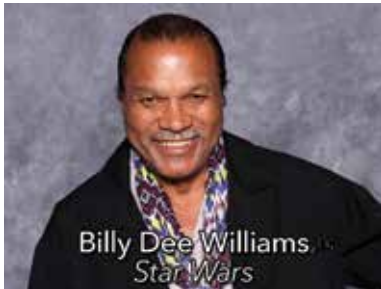
Billy Dee Williams Star Wars

Granitecon hosts hundreds of Guests from entertainment and comics. Guests participate in Panels, Q&A Sessions, Autograph Sessions, Photo Ops, Artist Alley and conduct interviews with members of the Press. Guests have included: