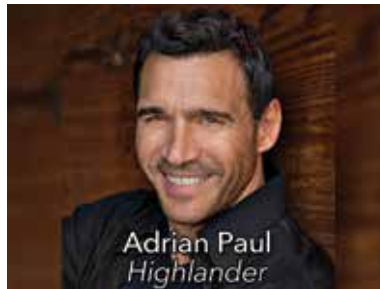
Adrian Paul Highlander