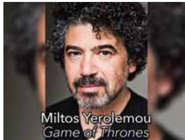
Miltos Yerolemou Game of Thrones